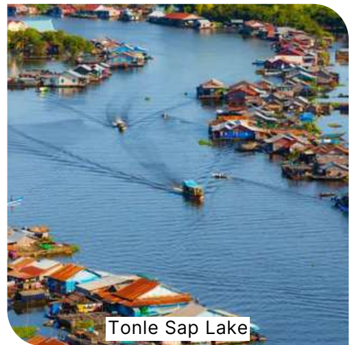
Tonle Sap Lake