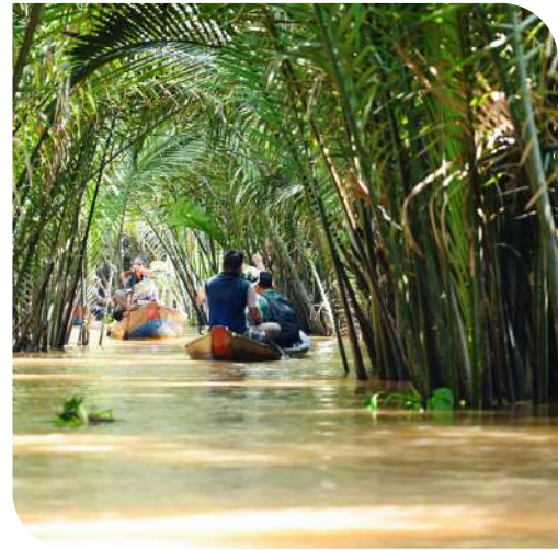
Thoi Son Island